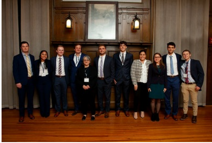
April 21, 2022 Awards Banquet Photos