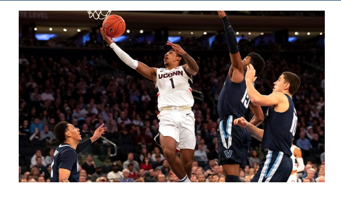
Limited number of seats availability -

The Center will host the alumni favorite pregame event at The REC Hartford . Special thanks to Sentry Commercial for sharing the 160 Trumbull Street 4th Floor space for this UConn alumni event.